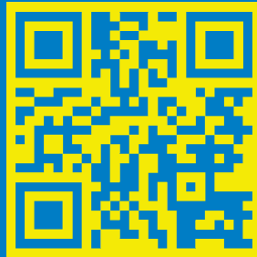
Meta Family Center for Resources