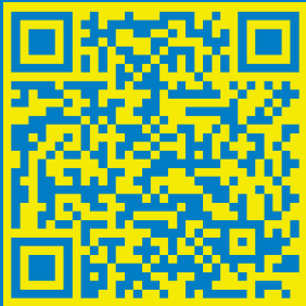
Safety Center resources and tools for Parents